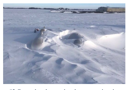
#2 Covered tanks creating dangerous situation