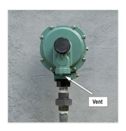
#3 Regulator on side of house, showing vent. Vent needs to be clear of snow and ice.