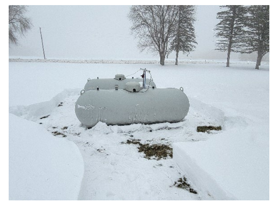
#1 Properly cleared access to tanks